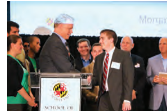
EIP ENTERS DO GOOD CHALLENGE FOR FIRST TIME