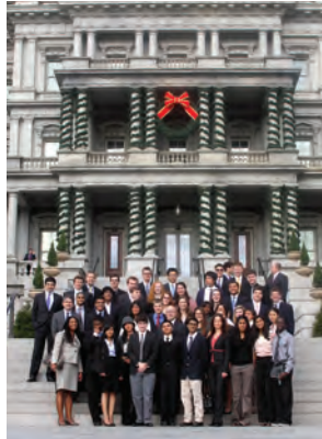
EIP INVITED TO WHITE HOUSE "I AM AN ENTREPRENEUR" EVENT