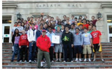
INAUGURAL COHORT COMPLETES CAPSTONE