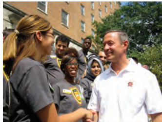
GOVERNOR MARTIN O'MALLEY VISITS