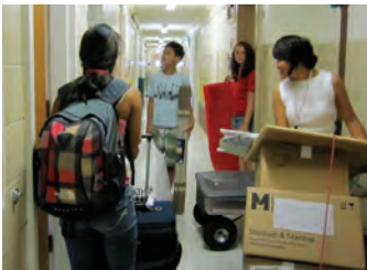
INAUGURAL COHORT MOVE IN