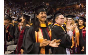
INAUGURAL COHORT GRADUATES FROM UMD